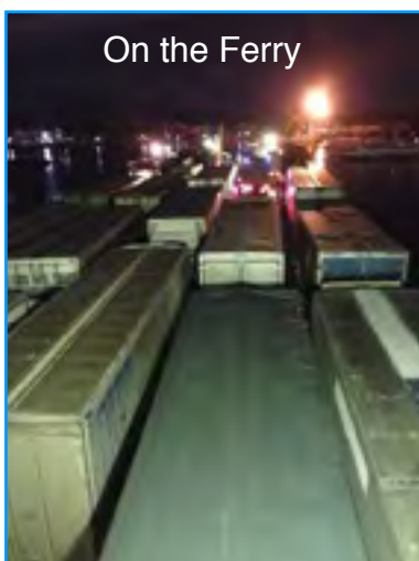
On the Ferry

It took us 47 hours to reach our base in Catbalogan, a city two hours away from Tacloban, with our van and a 10 wheeler truck.