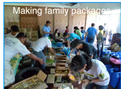
Making family packages

All families are also given a medical check up and time to talk with pastors on site. We spent more than a week of work on campus and endless miles of driving around completely wiped out towns and cities in Samar and Leyte, mapping out our next moves for relief aid and future rebuilding efforts.