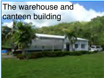
The warehouse and canteen building

As the team becomes acquainted with the evacuees and play around with the children, we will have a fair assessment of what will help the children suffering from traumas.