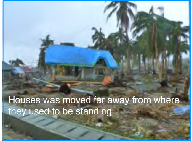
Houses was moved far away from where they used to be standing

Our trips were from 12 to 17 hours a day and it was a continuous disaster zone where people were left with only one option: get up the next morning and survive! No one was spared from this super typhoon. The houses of the rich were completely broken along with shanty towns, schools, old churches and government buildings.