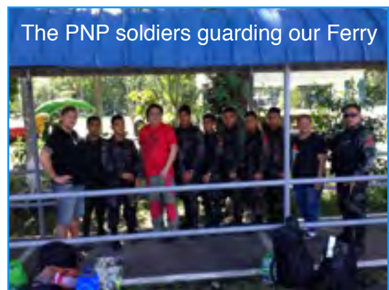
The PNP soldiers guarding our Ferry

It took us 47 hours to reach our base in Catbalogan, a city two hours away from Tacloban, with our van and a 10 wheeler truck.