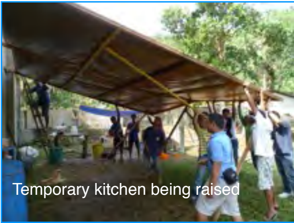
Temporary kitchen being raised

Even though many of the New Life buildings were damaged and some members still not accounted for, there's so far no reports of dead New Life members!