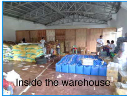
Inside the warehouse