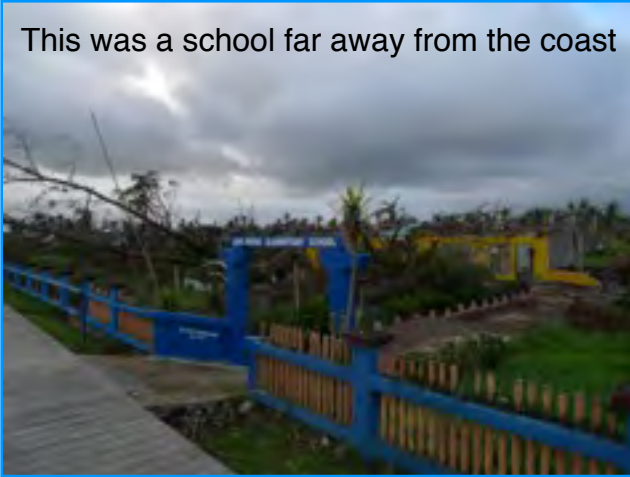
This was a school far away from the coast