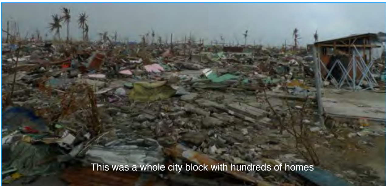
This was a whole city block with hundreds of homes