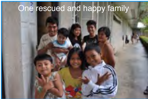
One rescued and happy family

Even though many of the New Life buildings were damaged and some members still not accounted for, there's so far no reports of dead New Life members!