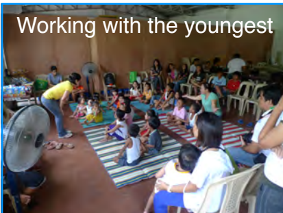
Working with the youngest