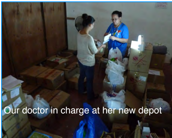
Our doctor in charge at her new depot

All families are also given a medical check up and time to talk with pastors on site. We spent more than a week of work on campus and endless miles of driving around completely wiped out towns and cities in Samar and Leyte, mapping out our next moves for relief aid and future rebuilding efforts.