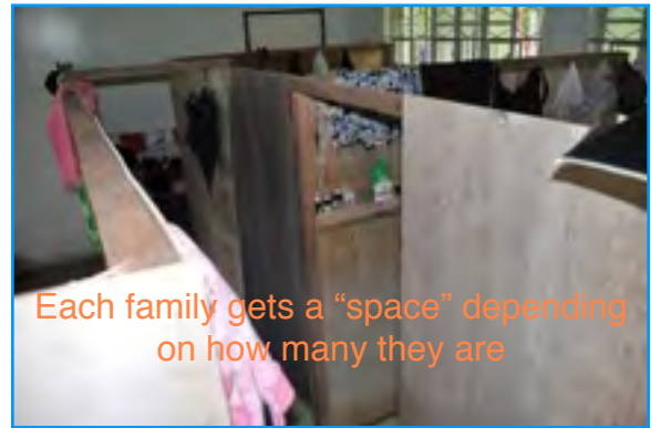
Each family gets a "space" depending on how many they are

We have heard many reports of survival miracles that we will post on Facebook or the New Life pages after they have been confirmed and typed.